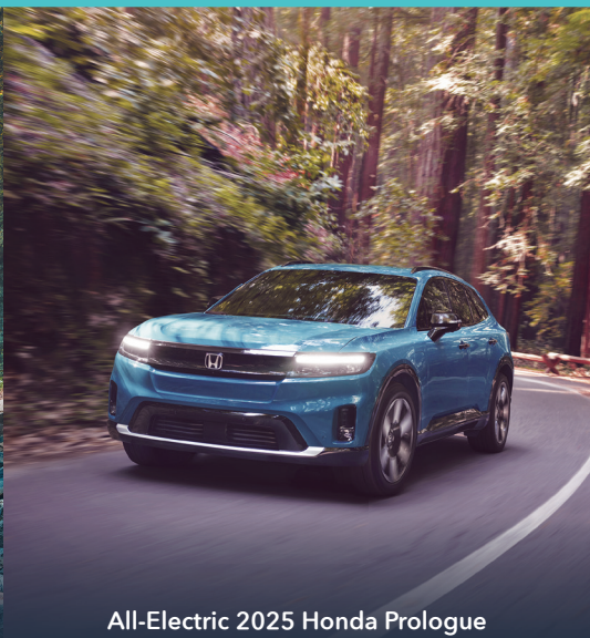
All-Electric 2025 Honda Prologue

At Faulkner Honda we believe in the Power To Be. The power to be part of something bigger than ourselves. The power to be change for good. The power to be a better neighbor. For over 90 years Faulkner has been honored to be a part of the communities we serve and to give back to those communities in every way we can. We hope you'll join us in supporting our communities and use your Power To Be. Faulkner Honda. To Be Sure.