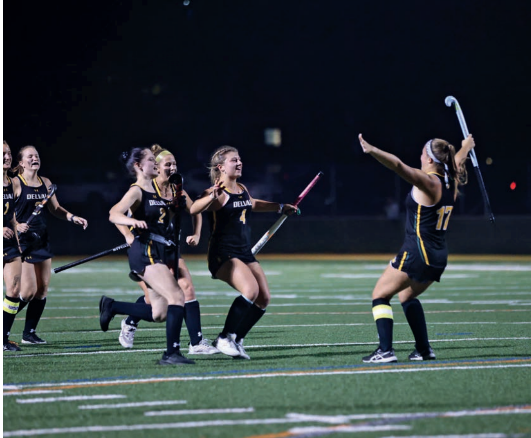
▲ Field Hockey celebrates during a 3-0 MAC Freedom win over Lycoming College