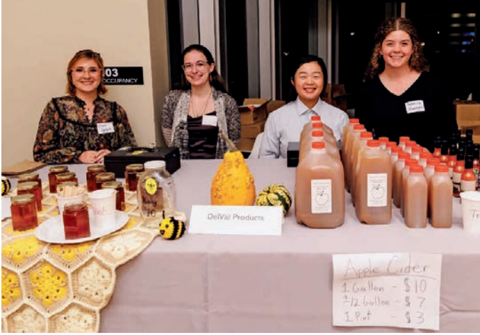
▲ Members of DelVal's Apiary Society and Horticulture Society selling DelVal products